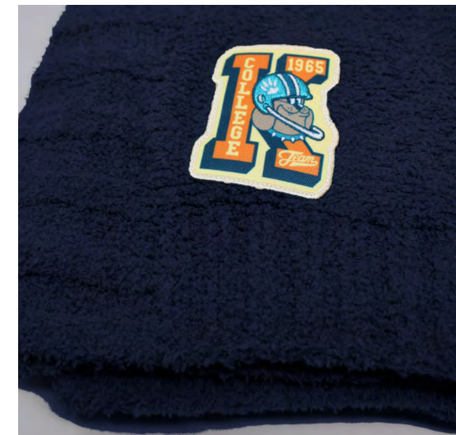
Print Stitch Emblem